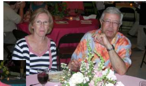
It really is tough to "keep up with the Joneses" when they look this good!