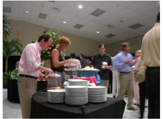
The last of the clean plates... The food was only surpassed by the company of our fellow Rotarians