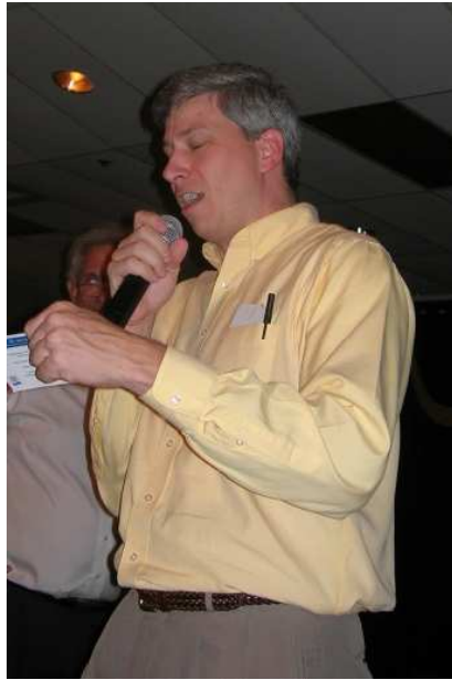
And the winner is .....

Your incoming board is beginning to focus on the upcoming Rotary year. If you are interested in serving as a chairperson of a committee or you are just interested in becoming part of a committee, please let me or a board member know. The board wants to get everyone involved!