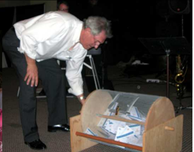
Where’s that “rabbit in the hat” I promised?