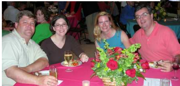
Who is that "un-bearded man" & why are these good-looking folks hanging around him?