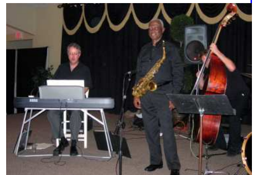
Another "un-bearded man" on the keyboard with talented musicians around him.