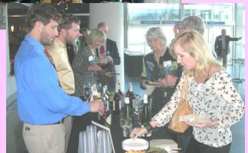
...the wine & view wasn't bad either!