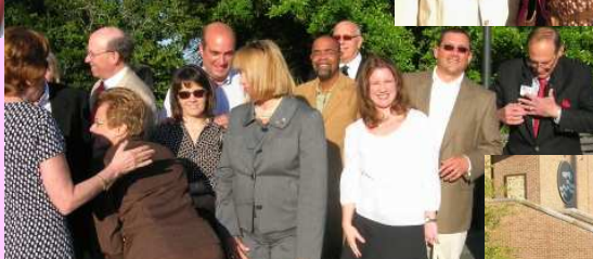
Thanks Fred...great pictures :-)