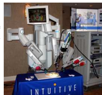
The deVinci Surgical Robot